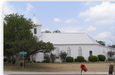
St. Aloysius Westhoff