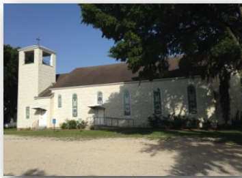
Sts. Peter & Paul Meyersville