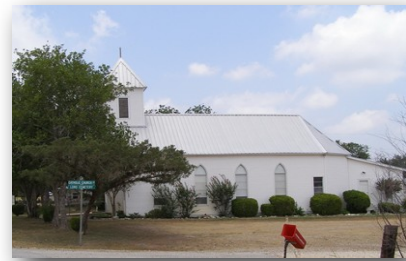
St. Aloysius Westhoff