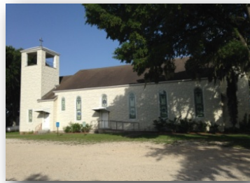
Sts. Peter & Paul Meyersville